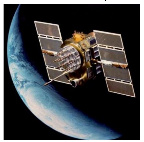
illustration: GPS satellite

operates at least two atomic clocks with an accuracy of at least 1 \times 10^{-12} . The time signal together with the orbit data is transmitted continuously at the frequency of 1,57542 GHz. The satellite data is transmitted at the speed of light (approximately 300,000 kilometres per second or approximately one billion kilometres per hour - exact value: 1,079,252,848.8 km/h).