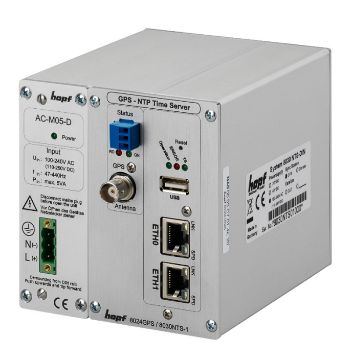
front view base system 8030NTS/GPS

The DIN rail network timeserver 8030NTS/GPS is ideal for everyone searching for a space-saving, flexible and cost-efficient solution with numerous configuration and extension options. Due to the configuration and extension options you can specify the functions of your individual 8030NTS/GPS timeserver at time of purchase.